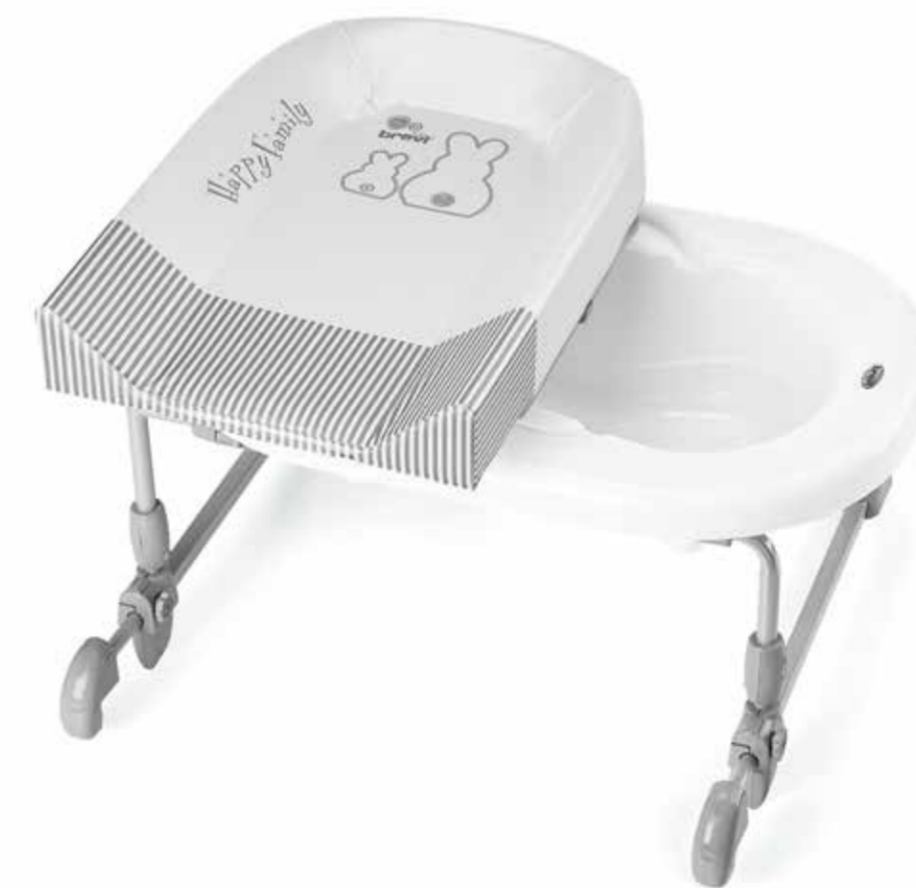
Bianconiglio Item 594 Col. 501