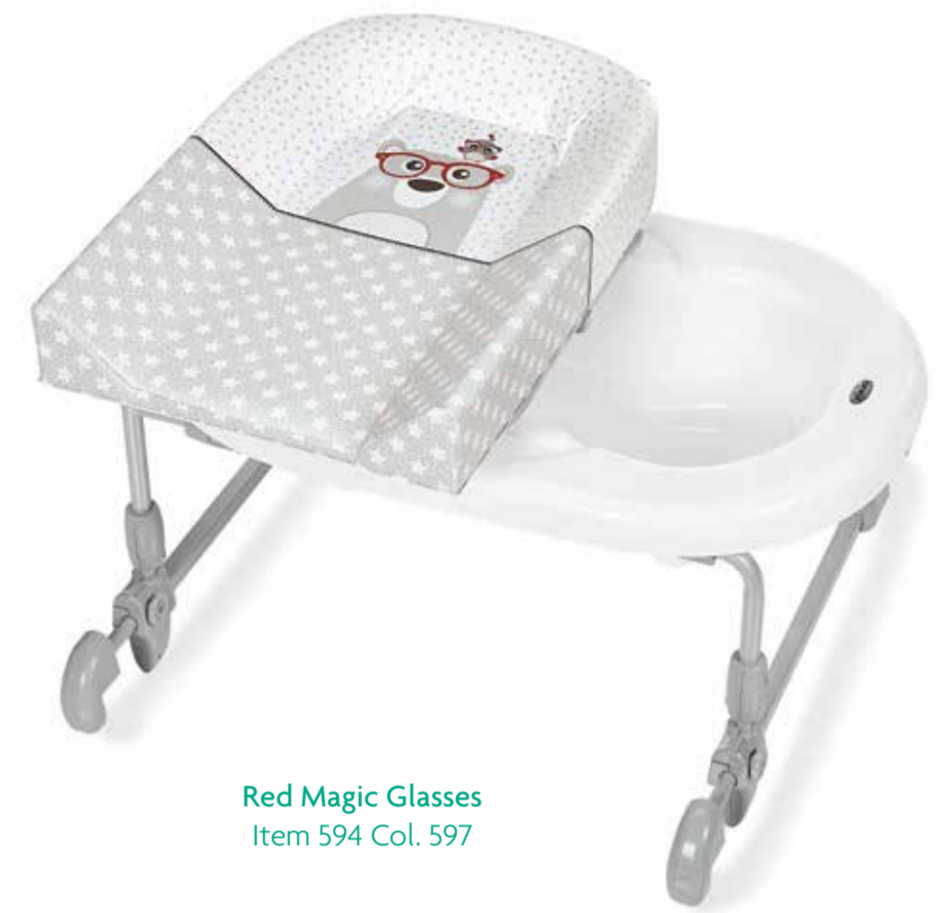
Red Magic Glasses Item 594 Col. 597