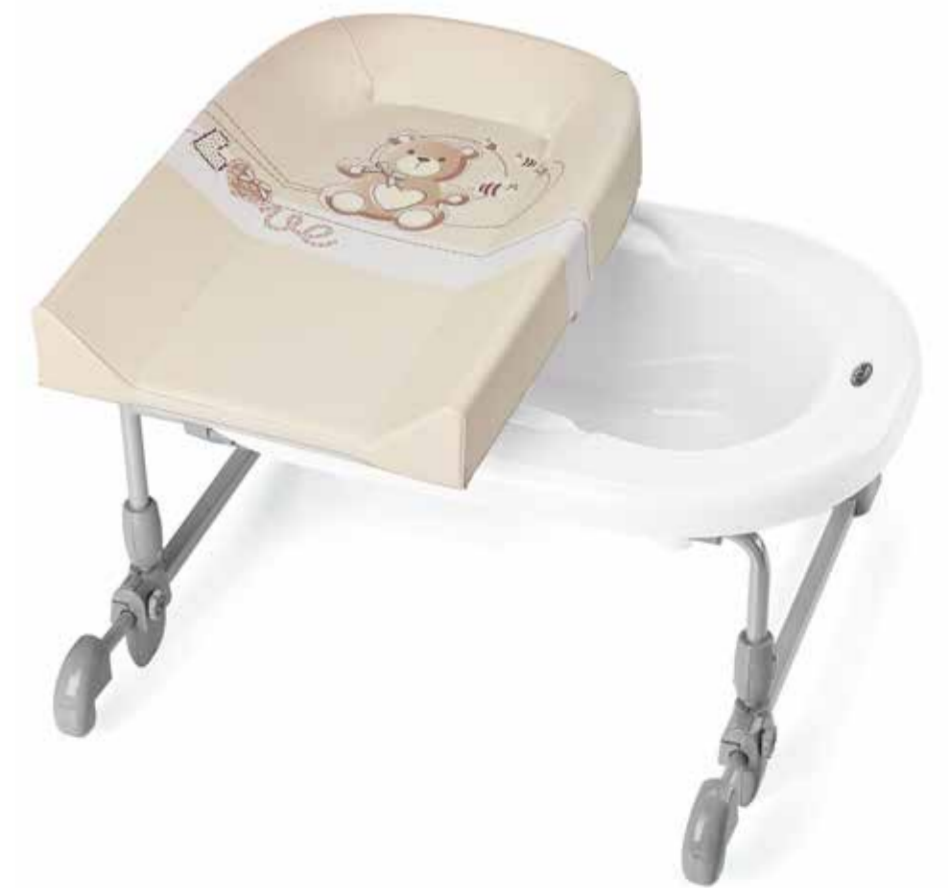
My Little Bear Item 594 Col. 553