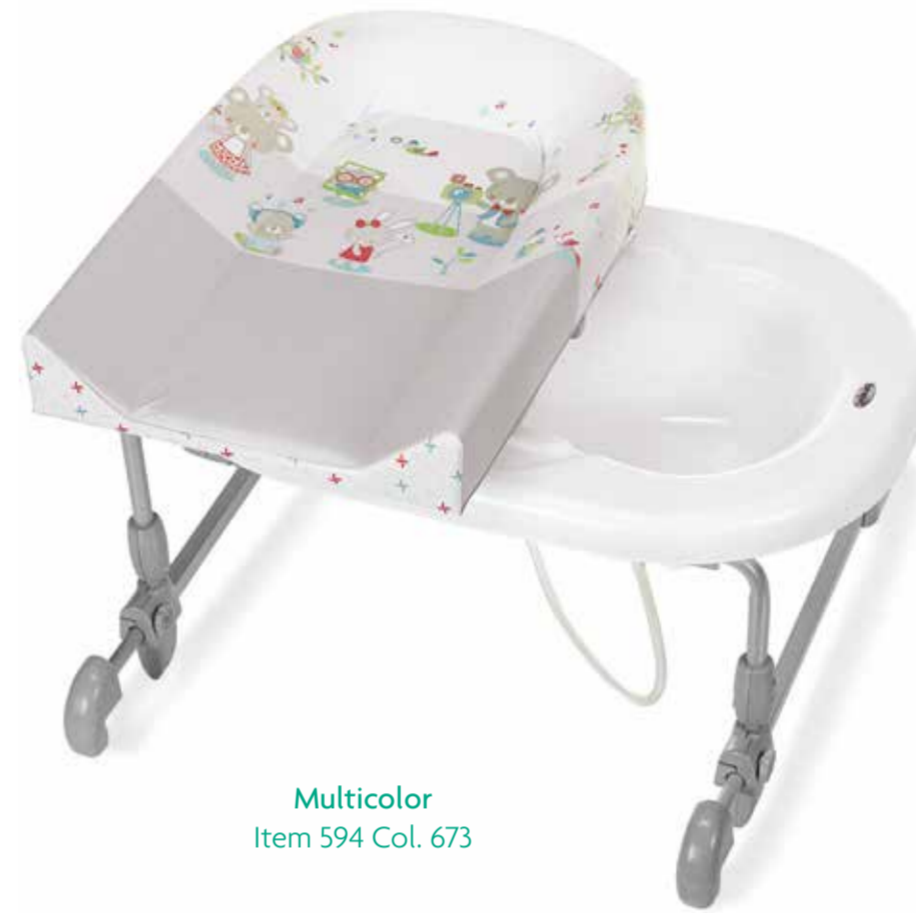
Multicolor Item 594 Col. 673