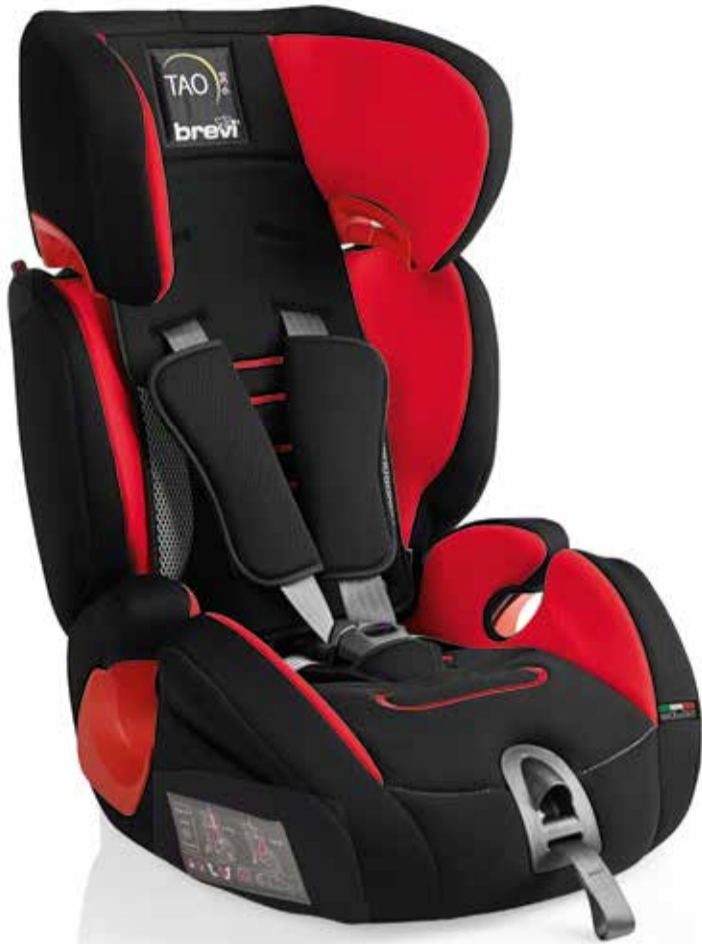
Red Item 531- Col. 233