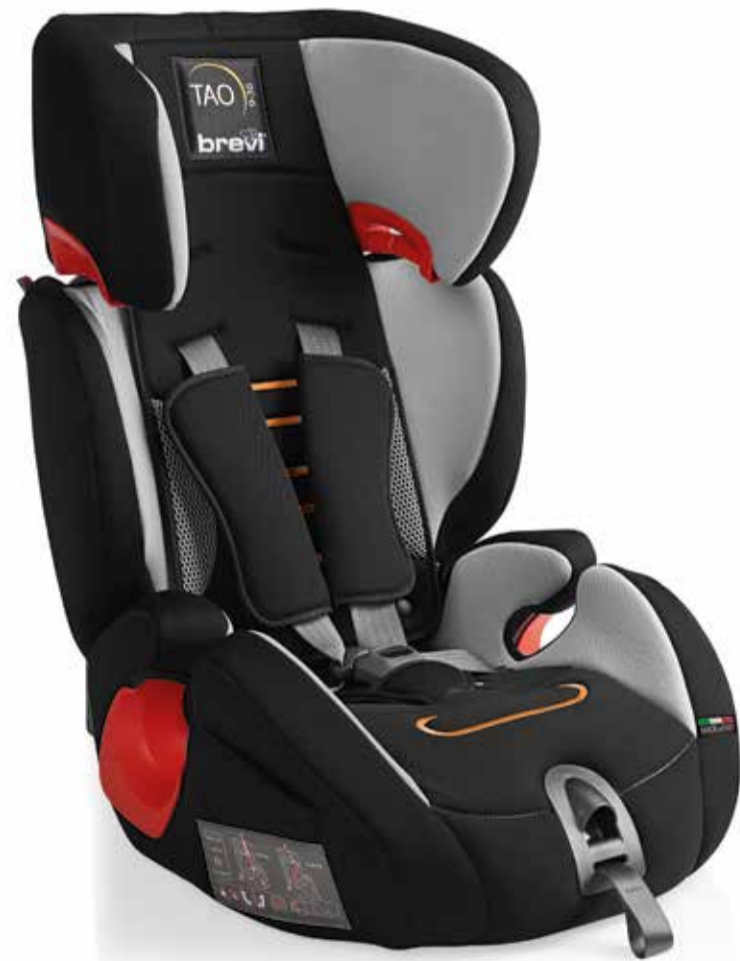
Grey Item 531 - Col. 077