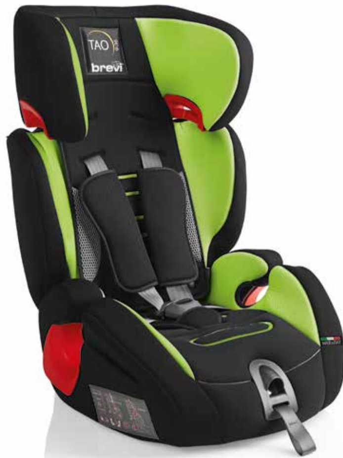
Green Item 531 - Col. 262