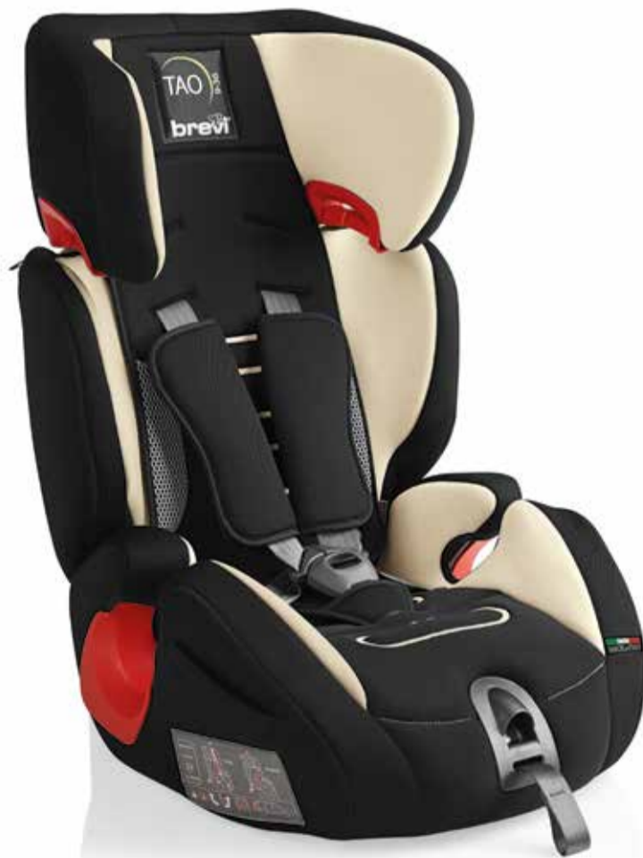
Cream Item 531 - Col. 067